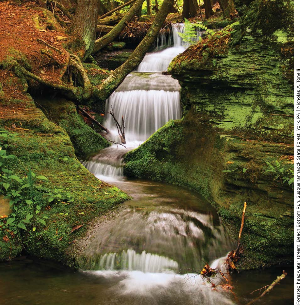
Download this report at AmericanRivers.org/DaylightingReport

Robust scientific research consistently shows the importance of small streams to downstream communities. Preserving and protecting small streams, therefore, is the best approach to conserve ecosystem function, but in highly urbanized areas where headwater streams are often buried, hidden, and forgotten, this approach is not an option. With the understanding that most urbanized streams are buried and therefore unable to be preserved, stream daylighting becomes a valuable option to improve water quality and habitat, reduce flooding, and revitalize communities. While a relatively new approach, daylighting is a promising technique assisting communities in reducing polluted runoff, addressing flash flooding concerns, and improving the livability of the built environment.