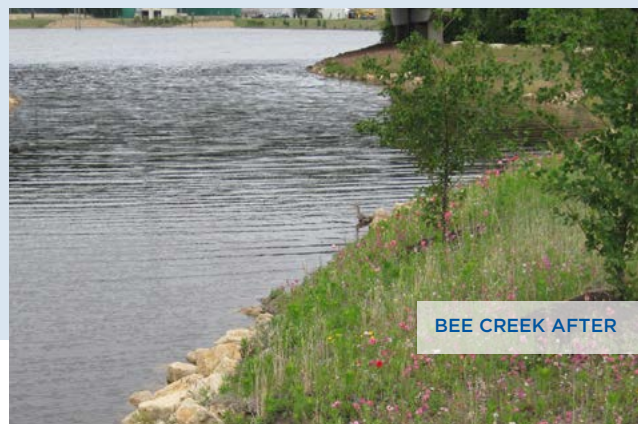
Bee Branch Creek before and after daylighting, Dubuque, IA